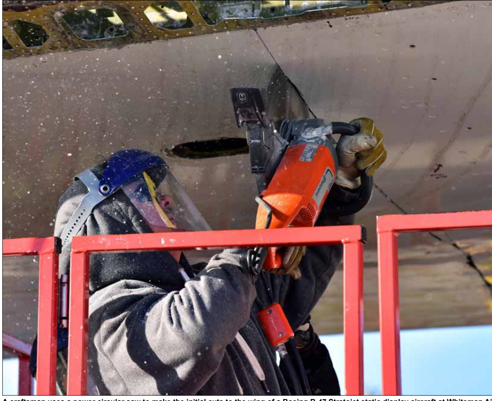
A craftsman uses a power circular saw to make the initial cuts to the wing of a Boeing B-47 Stratojet static display aircraft at Whiteman Air Force Base, Mo., Dec. 6, 2016. The aircraft is scheduled to be moved to be a part of the new heritage park.