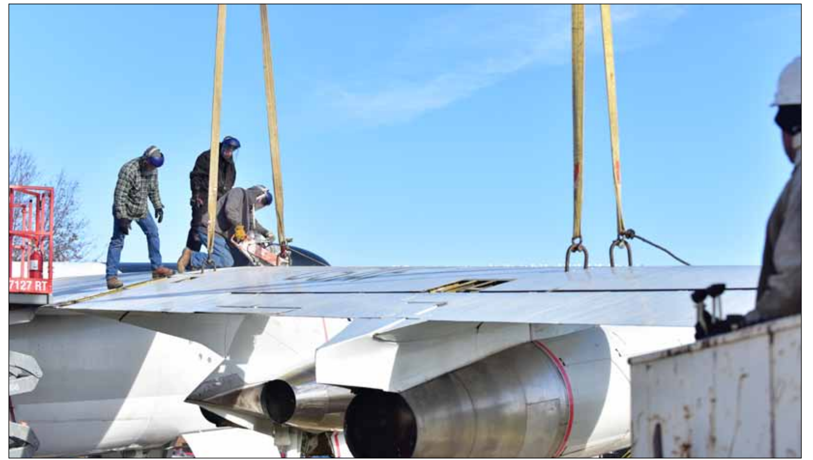
Several civil engineers work together to remove the wings of a Boeing B-47 Stratojet static display aircraft Dec. 6, 2016. The static display is scheduled to be a part of the new Heritage Museum at Whiteman.